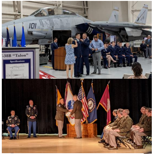
May 2022 Air Force and Army ROTC commissioning ceremonies for EKU HLS students.

In summary, an array of opportunities exists for homeland security graduates. Though public and private sector positions in homeland security and emergency management may be found throughout the country, there are concentrations of positions in the larger U.S. cities (such as the Washington, D.C. area), at international airports, and in areas near U.S. land and sea borders. The College of Justice, Safety and Military Science and the <u>EKU Office of Advising and Career Services</u> assist students in identifying employment opportunities.