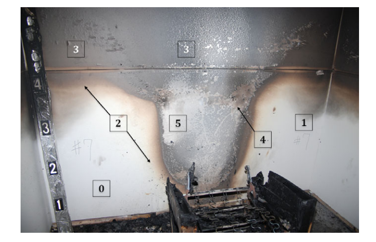
FIG. 1—Photograph from which selected images of visible damage indicators was chosen for use with the DOFD Method.

each grid space and characterize the damage within that space. The method further instructed the user to use the example images and damage indicators to characterize the damage observed. Additional instructions were provided to clarify those potential areas of difficulty in ranking. These instructions indicated that the user should be conservative and select the degree of damage with the lower value in the event that the grid space